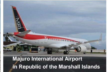
Majuro International Airport in Republic of the Marshall Islands