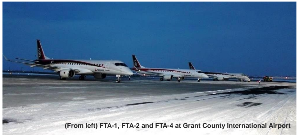
(From left) FTA-1, FTA-2 and FTA-4 at Grant County International Airport

In addition to the pilots, engineers observing monitors sat at the rear of the MRJ during the ferry flight. They support flight safety by watching over a wide range of data collected from the MRJ such as the speed, attitude, temperature and vibration, and confirming that the data is normal.