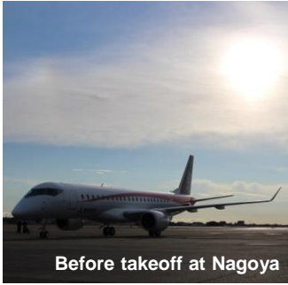
Before takeoff at Nagoya