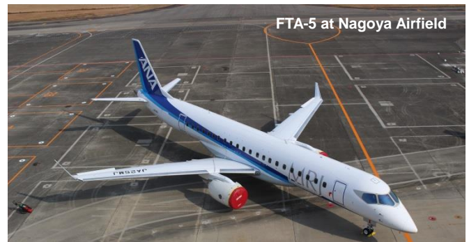
FTA-5 at Nagoya Airfield

Flight Test Aircraft No. 5 (FTA-5) underwent an APU parking noise test at Nagoya Airfield on November 30. The test was conducted to evaluate the aircraft's design for APU parking noise. Microphones were positioned around the airframe to acquire noise data during APU operation. The test was successful, confirming that the noise data satisfied design requirements.