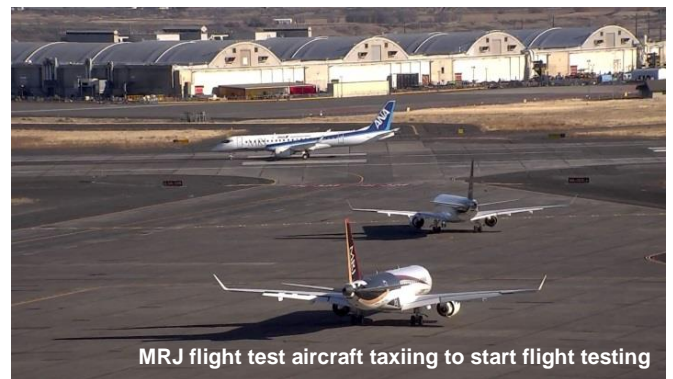
MRJ flight test aircraft taxiing to start flight testing

http://progress.flythemrj.com/inside-moses-lake-flight-test-center .