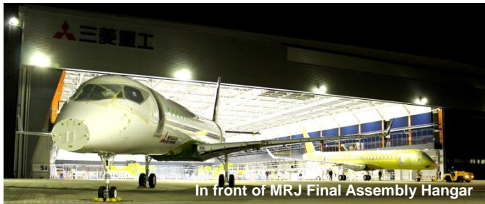
In front of MRJ Final Assembly Hangar

Two MRJ90s were taken to the Paint Hangar from late October through early December. It was the first use of the Hangar constructed adjacent to the MRJ Final Assembly Hangar. Both aircraft were painted in a simple white color scheme with the distinctive "MRJ90" logo added to the vertical tail surface. We continue moving forward with manufacturing the aircraft that will incorporate design changes. We plan to allocate roughly two additional MRJ90s for flight testing.