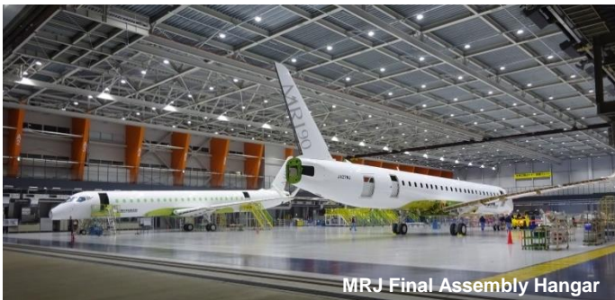
MRJ Final Assembly Hangar

Two MRJs in the MRJ Final Assembly Hangar after painting